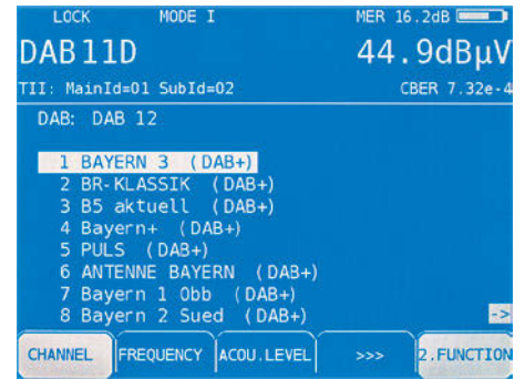
Measurement of the DAB + transponder 11D with level, MER and channel BER.

Tattenhausen · Raiffeisenstraße 9 · 83109 Großkarolinenfeld · Germany Telefon 00 49.(0) 80 67 .90 37-0 · Telefax 00 49.(0) 80 67 .90 37-99 info@kws-electronic.de · www.kws-electronic.com