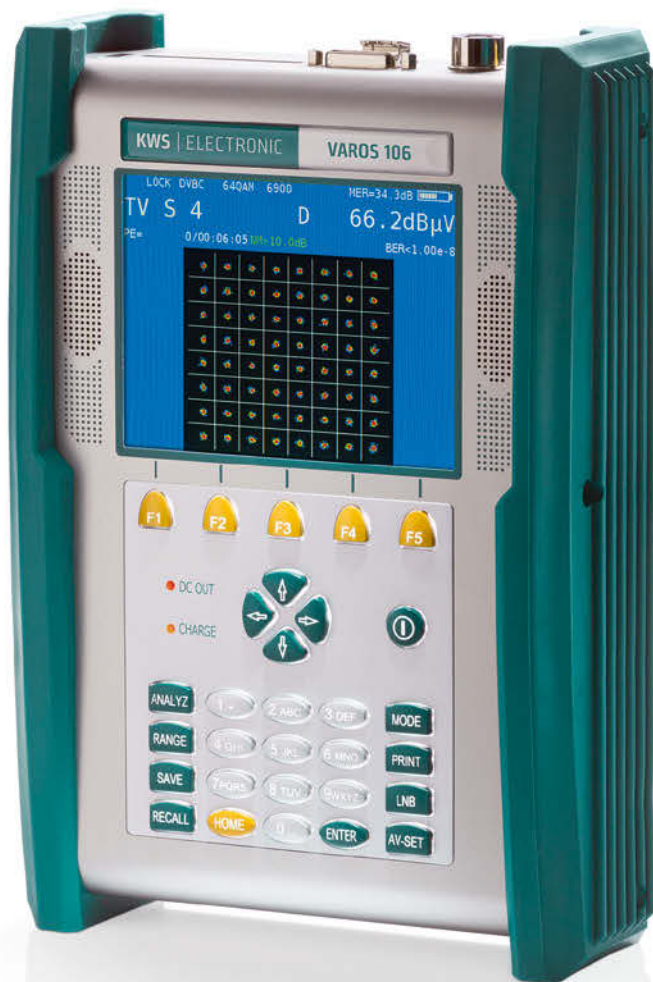
Dimensions in mm: 206 w × 297 h × 84 d Weight: 2.5 kg

The technical data and device-specific downloads can be found on our homepage www.kws-electronic.com .